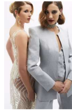
GST_203 dress GST_130 blazer GST_131 vest GST_361 trousers