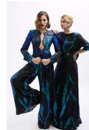
GST_140 blazer GST_401 top GST_350 trousers GST_302 skirt