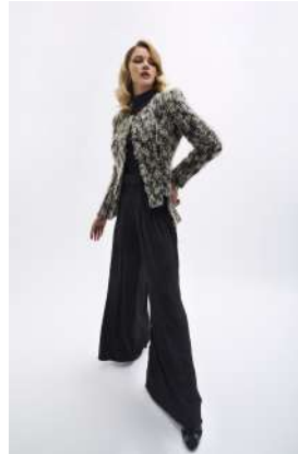
GST_112 jacket GST_485 lupetto GST_380 trousers