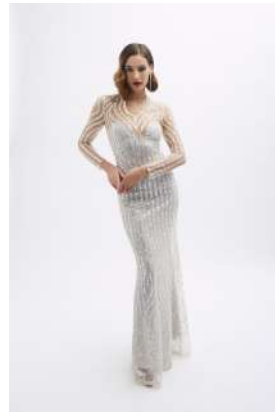
GST_201 long dress