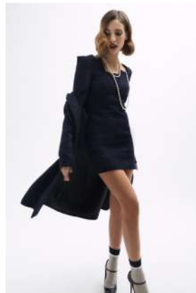
GST_114 coat GST_210 dress