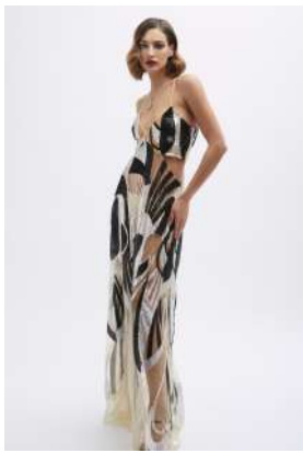
GST_203 long dress