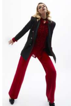
GST_125 piping blazer GST_410 shirt GST_357 trousers