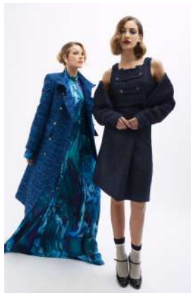
GST_110 coat GST_115 jacket GST_215 dress GST_116 vest GST_301 skirt