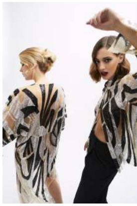
GST_204 kaftan (left) GST_405 shirt (right)