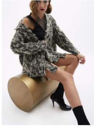
GST_113 over jacket GST_481 top GST_300 skirt