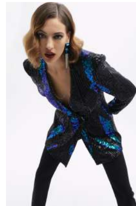
GST_150 blazer GST_360 trousers