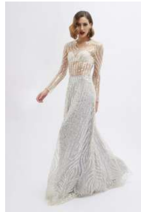
GST_404 top GST_303 long skirt