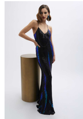
GST_200 long dress