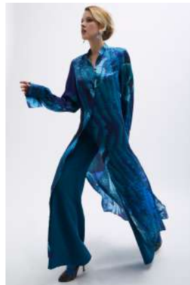
GST_216 long shirt GST_358 trousers