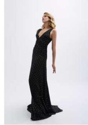
GST_211 long dress